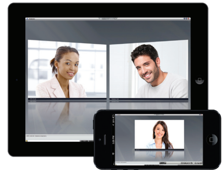
Spontania cloud-based media collaboration