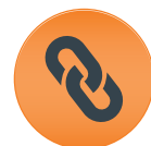
IP PBX and Call Center Integration