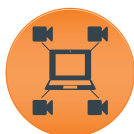
Multi-Input Video Capture